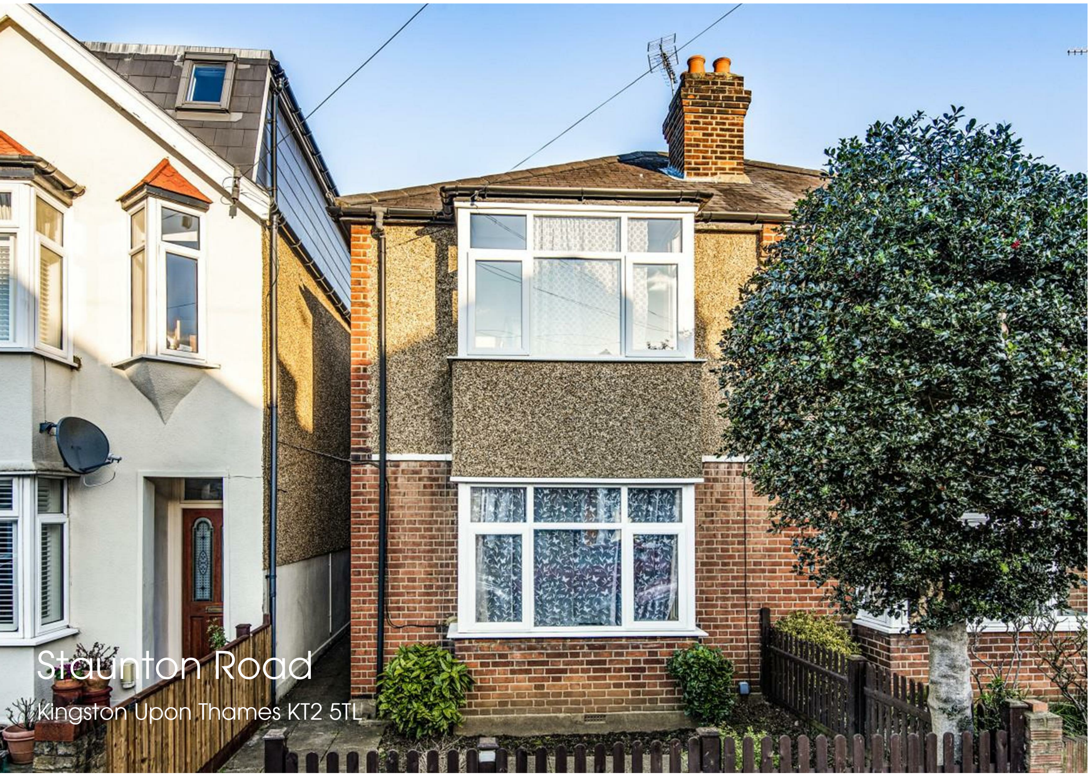
Staunton Road Kingston Upon Thames KT2 5TL